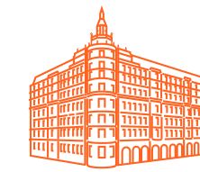
Hotel Baltschug Kempinski